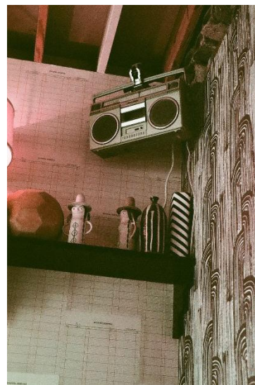
'Someone Still Loves You' by Nicole Jendrusina, Photography, 15x21 inches, $300.