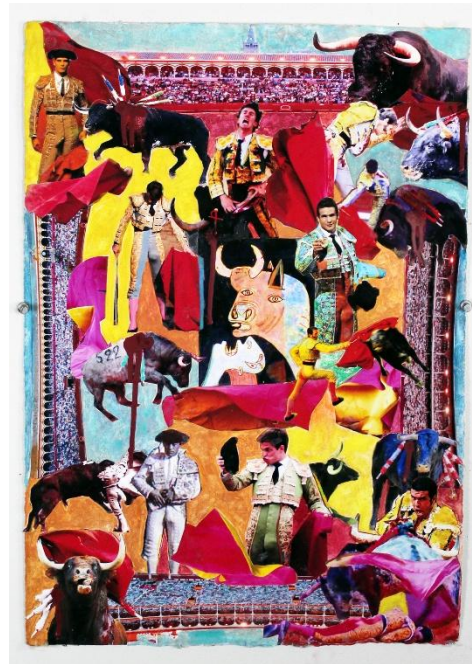
'Bulls' by Gary Eleinko, Mixed media collage, 20x14 inches, $225.