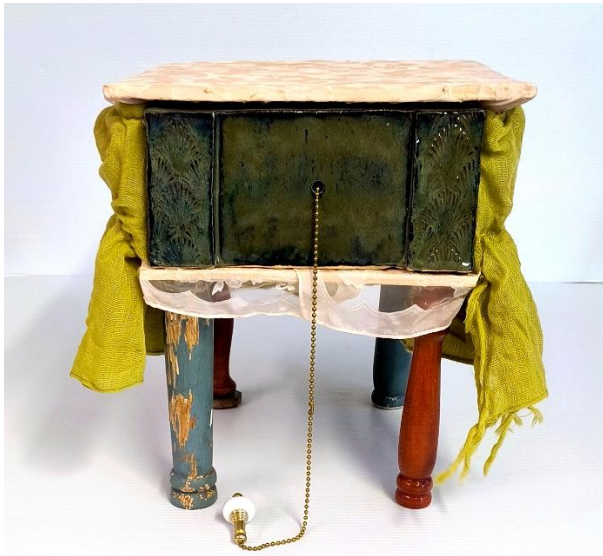
'No Table of Mine' by Nickie Gunning, Stoneware, hardware, found objects, 12x11x13 inches, $800.