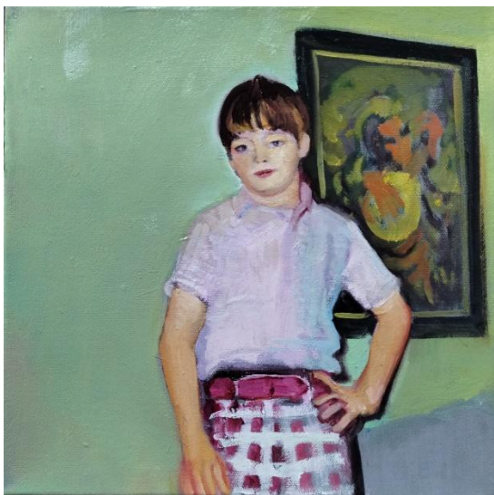
'Fancy Pants' by Tom Livo, Oil on canvas, 12x12 inches, $650.