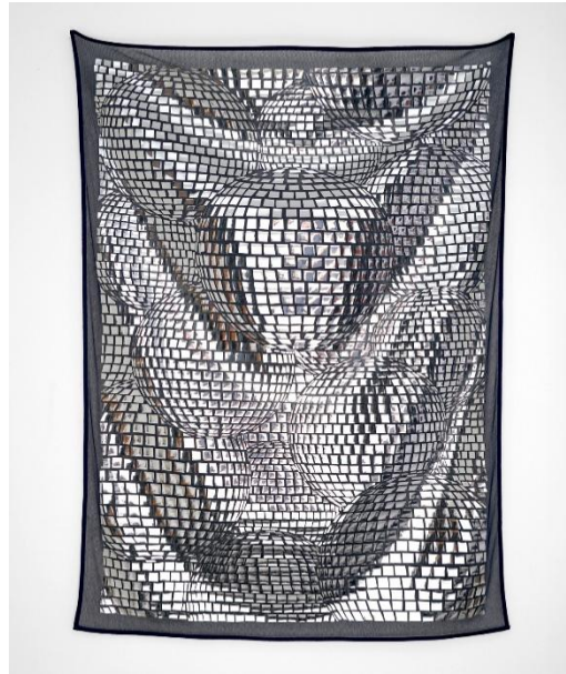
'Gossamer Night 2' by Jeremy Noonan, Cotton bobbinet, reflective vinyl, bias tape, 40x28 inches, $3,000.