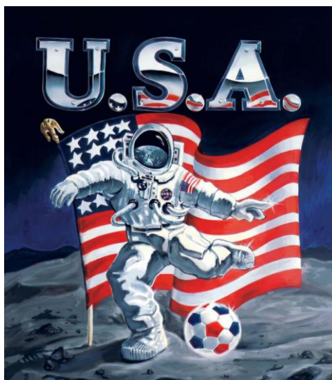
United States by Chazz Miller, 49x35 inches, Acrylic on canvas, 1994.