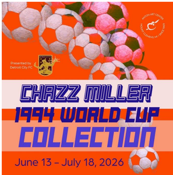
Chazz Miller: 1994 World Cup Collection exhibit graphic.