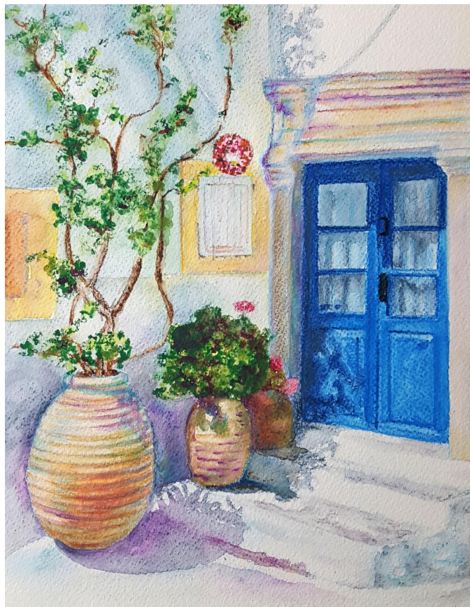
Cerulean Blue , Colored Pencil Fay Akers