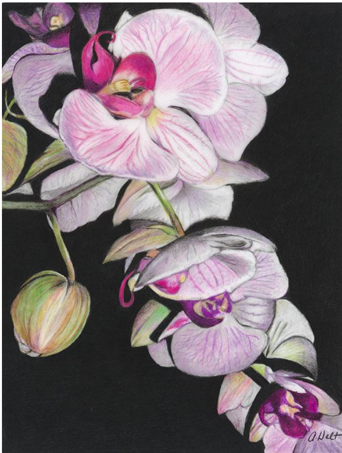
Untitled , Colored Pencil Angie Helt