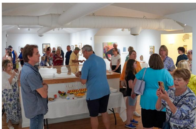
Gallery view, Anton Art Center, Annual Artist Choice Show Opening Reception event, 2024.