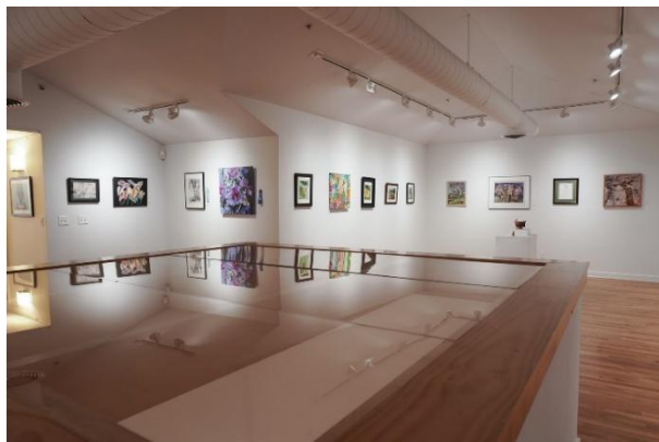
Gallery view, Anton Art Center.