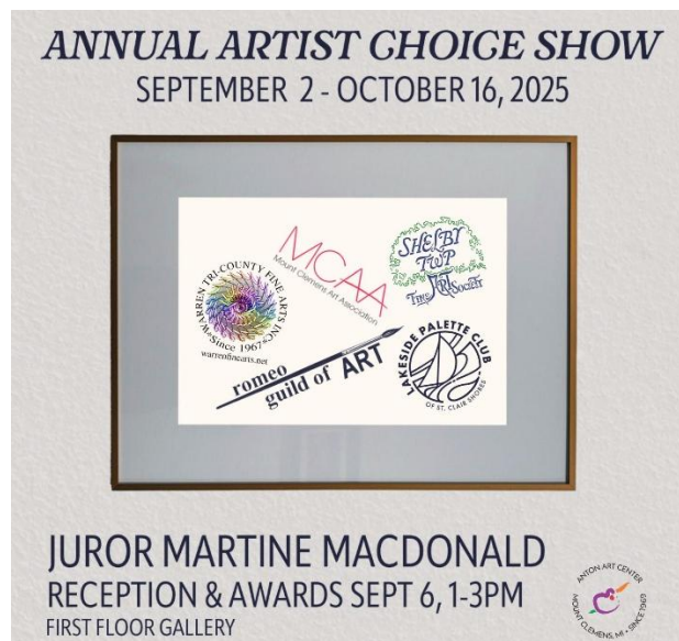
Exhibition graphic, Annual Artist Choice Show.