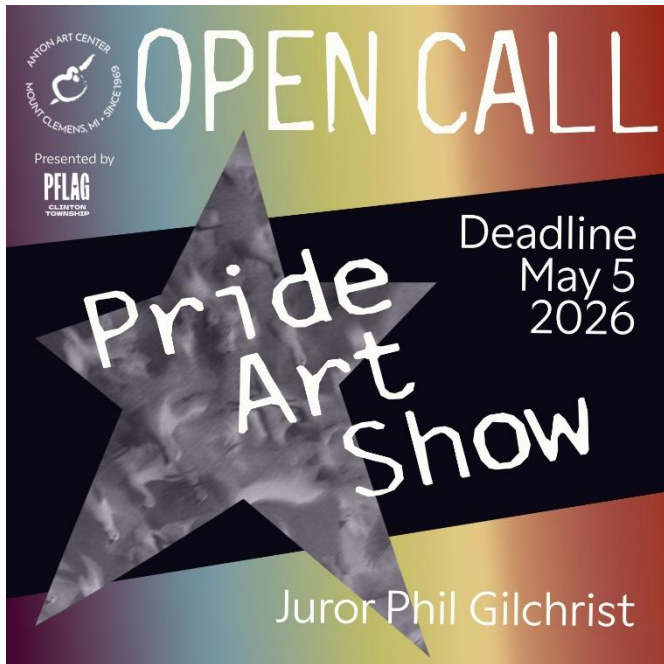
'Pride Art Show' call for entry art competition and exhibition graphic.