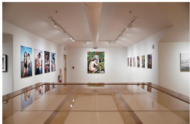
Gallery view, Second Floor Gallery, Anton Art Center.