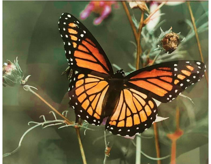
Welcome Spring