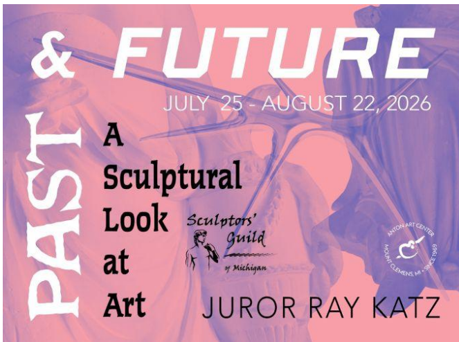
'Past and Future: A Sculptural Look at Art' exhibit graphic.