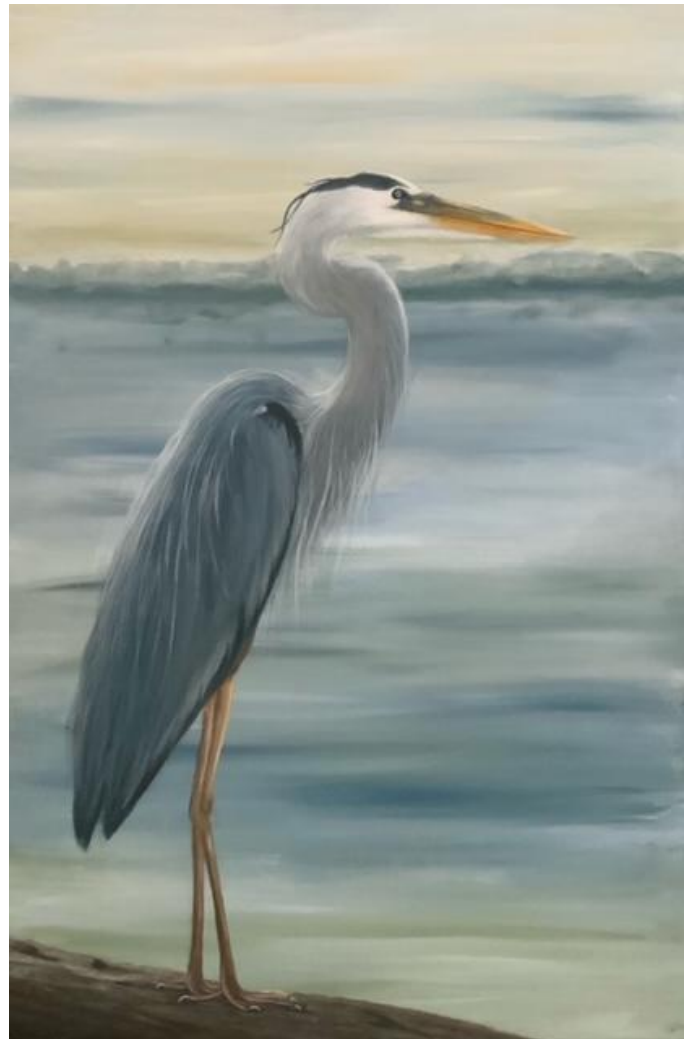
Just Wading, Acrylic paint on canvas Bea Allebone, Shelby Township Fine Art Society