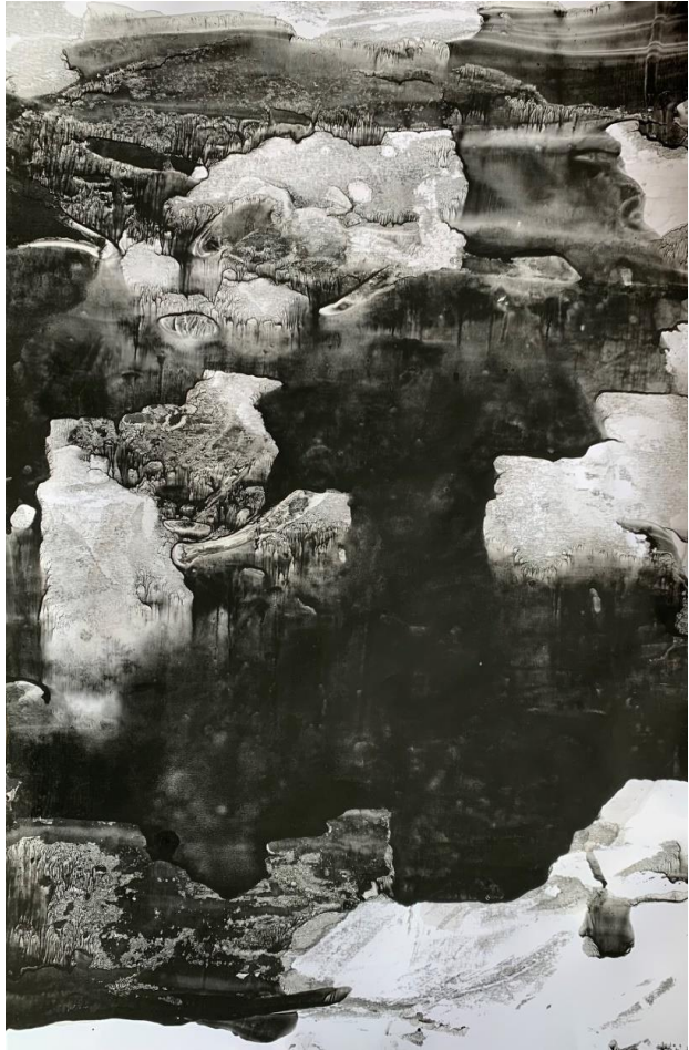
Ode to a Nightingale 1 , Monotype, Luzhen Qiu