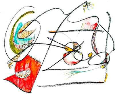
"It's Hot" by Nanci LaBret Einstein. Pencils, 11x14 in., $325.