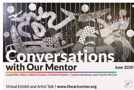
Conversations with Our Mentor exhibit postcard designed by Anton Art Center.